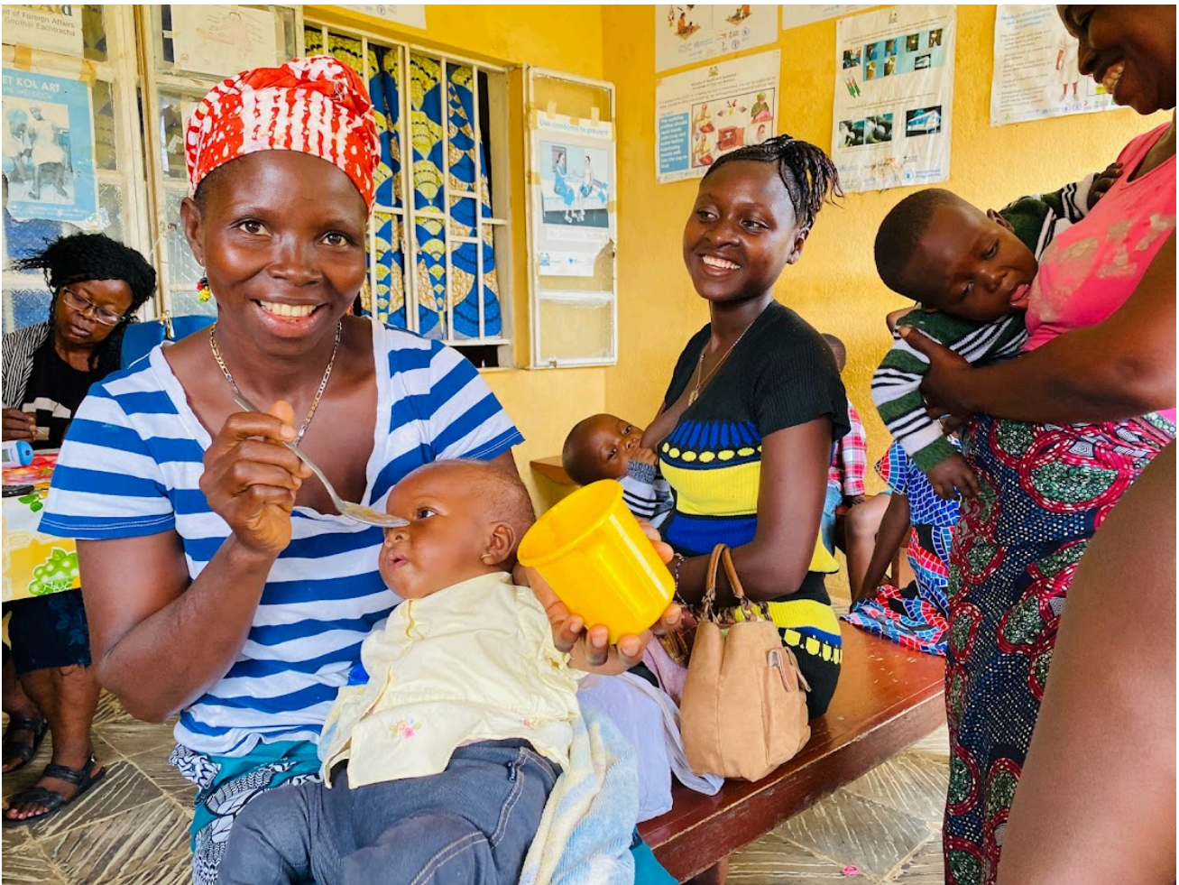
Due to a shortage of nutritious meals, many children in rural Sierra Leone experience stunted growth. Their mothers take action by growing nutritious vegetables.

Our strategy in Europe is guided by the overall vision and mission of the Solidaridad Network. Our vision is a world where all we produce and consume can sustain us, the planet and the next generations. Our mission is to enable farmers and workers to earn a decent income, shape their own future, and produce in balance with nature by working throughout the whole supply chain to make sustainability the norm.