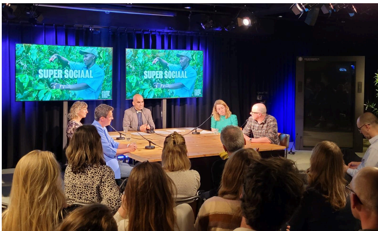
In May 2023, Solidaridad co-organized an event in Amsterdam to discuss the findings from our 'Superlijst Sociaal' supermarket campaign.

Whilst farmers play an essential role in the transition to a carbon-neutral economy and ensuring food security, they should also be paid for their ecosystem services, in addition to the food they produce. Moreover, this is also a win-win for companies interested to invest in this future-proof solution to help tackle climate change.