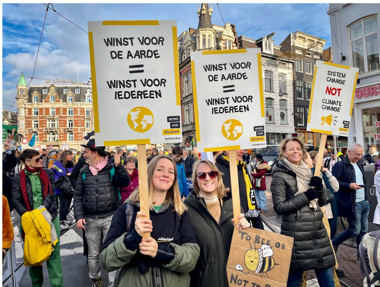
85 thousand people joined the March for Climate and Justice in Amsterdam on 12 November 2023, including some staff of Solidaridad Europe. The march is an initiative of the Dutch Climate Crisis Coalition.

As the world is facing multiple challenges, with a worsening climate crisis; armed conflicts; shrinking civil space and a backlash on human rights and on women's rights, this contributes to growing global inequality and a widening social and political division across various regions.