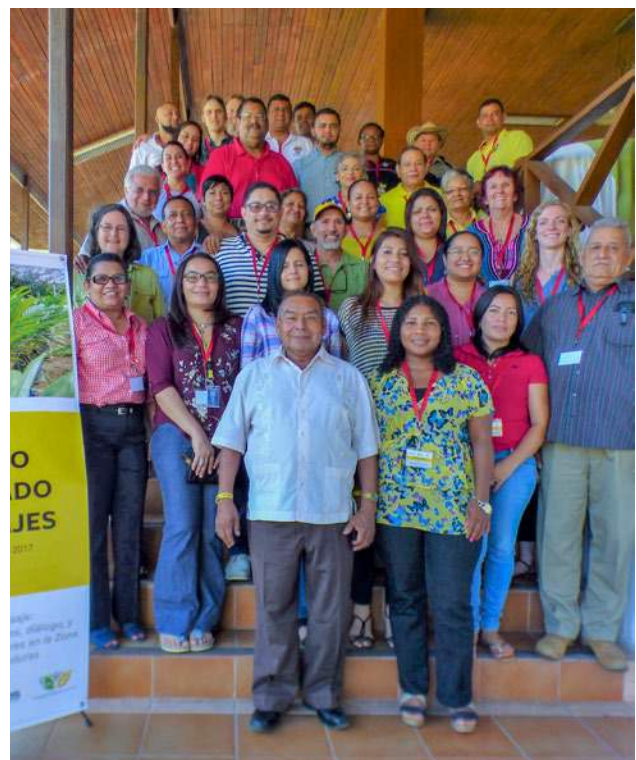
Representatives of social enterprises like Hondupalma, private oil palm companies, municipal leaders, and many other stakeholders during the first Integrated Landscape Management Workshop, May 2017

In 2017, Solidaridad found a perfect opportunity when working with the oil palm sector in Honduras, to move from a focus on farms and processing plants to a landscape-level approach, because of the inclusive nature of the agricultural economy in the sector. To do so, Solidaridad created the Sustainable Landscapes Programme (Paisajes Sostenibles – PaSos) to continue facilitating dialogue, building consensus between farmers like Fausto, social enterprises like Hondupalma, and private companies – but also including municipal leaders, water councils, tourism boards, environmental associations, cacao producers, and many other stakeholders, to find solutions at the broader landscape level that benefit everyone. And when the private sector, cooperatives, and local government work together effectively, the